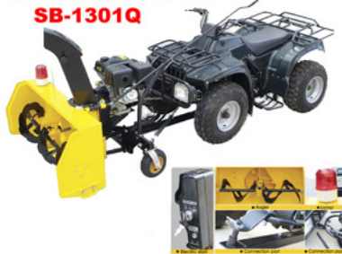
13HP Snow Thrower SB-1301Q